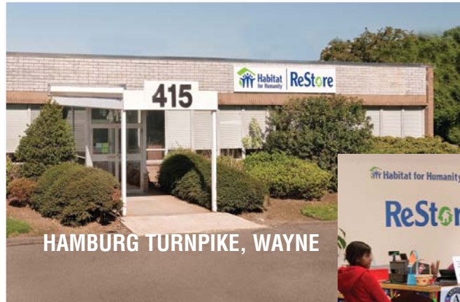
HAMBURG TURNPIKE, WAYNE

It also offers a one-stop opportunity to support Paterson Habitat in multiple ways. You can make a purchase, donate an item for sale or volunteer to help at the ReStore. We always need volunteers to help serve customers and do behind the scenes work like arranging displays and picking up donated items and delivering them to the ReStore. Volunteers who can come in regularly for a few hours each month are particularly needed.