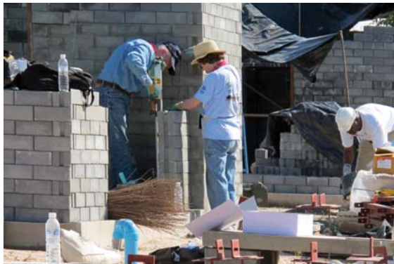
Paterson Habitat's last built with the Carters in Thailand during the Mekong Build, 2009.