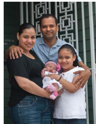
The Ferreira family at the dedication of their new townhouse on Summer Street.

We know the 4th Ward is still very much a neighborhood in transition and many problems remain. But thanks to your support, potential is transforming into progress and building the foundation for a better future.