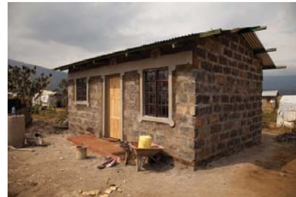
In 2011, Paterson Habitat visited Maai Mahui, Kenya to build HFHI's 500,000th home

If you'd like more information please contact: trips@patersonhabitat.org