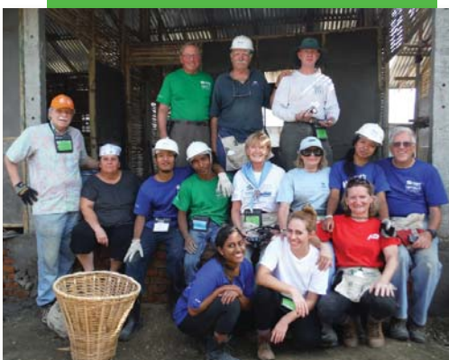
A Paterson Habitat team "travel with a purpose" on the last day of the Everest III Build in Nepal, November 2014.