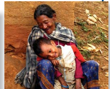
Faces of Nepal