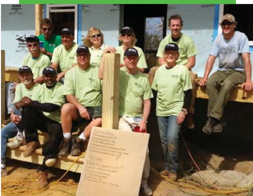
Paterson Habitat team in Bay St. Louis, February 2014. This is the 7th rebuilding trip to this coastal town in Mississippi since Hurricane Katrina.