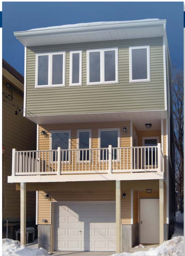
59 Godwin Avenue

The Godwin Avenue house is Paterson Habitat's first split-level home, designed for maximum light and easy flow between rooms. It reflects Habitat's green environmental requirements, and meets Energy Star® Version 3 green building standards. This makes it an energy-efficient, durable home that will be affordable to maintain, with lower utility bills for the homeowner family.